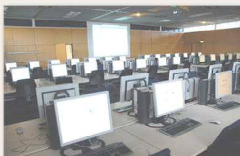
Testcenter University Bremen